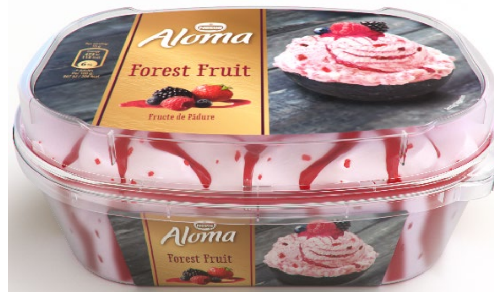
ALOMA Forrest Fruits 6x900ml Vanilla mix and forest fruit syrup with forest fruit pieces