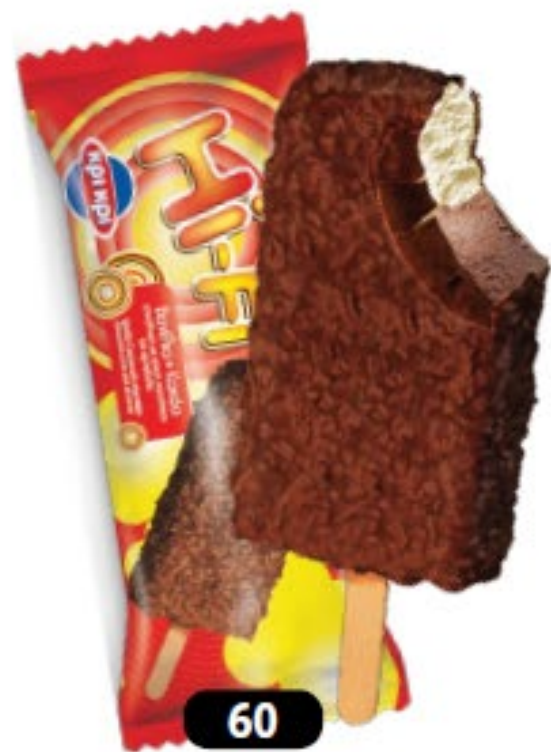
Vanilje & Kakao