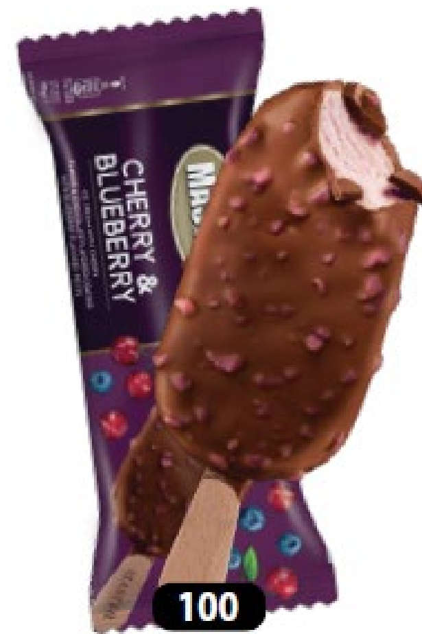
Qershii & Boronica