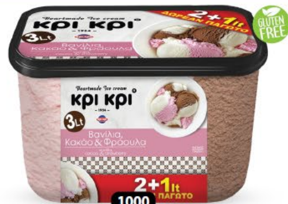
Vanilje, Kakao & Luleshtrydhe