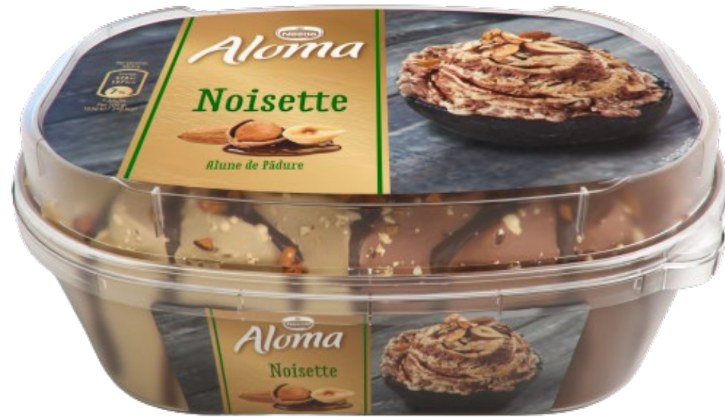
ALOMA Noisette 6x900ml Hazelnut and biscuit mix with cocoa cream and hazelnuts and caramelized almonds