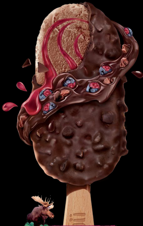
DARK CHOCOLATE & NORDIC BERRY