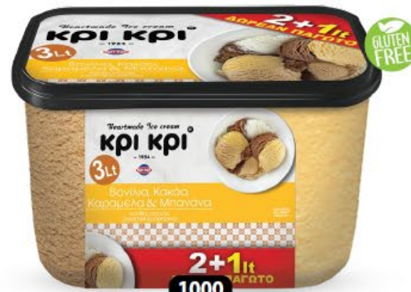
Vanilje, Kakao, Banane & Karamel