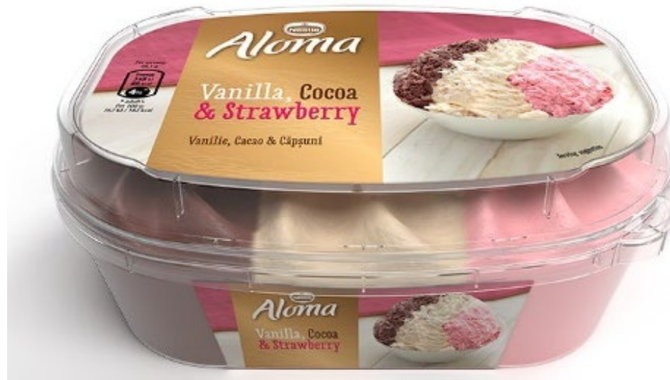
ALOMA 3in1 Classic 6x900 ml Miks cacao, vanilja dhe luleshtrydhe