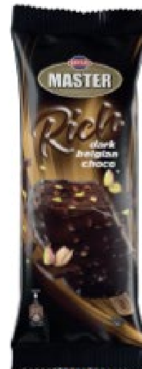
200 Dark Çokollatë Belge