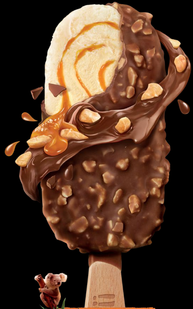
SALTED CARAMEL & AUSTRALIAN MACADAMIA