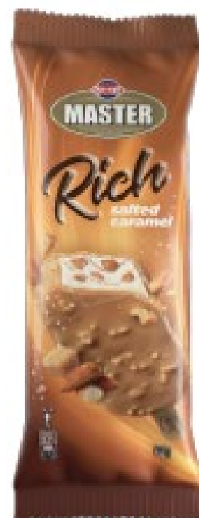
200 Karamel i kripur