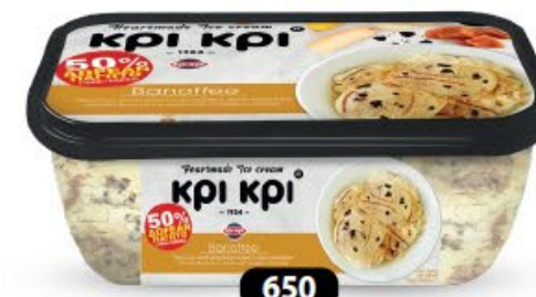
Banane, Biskotë & Karamel