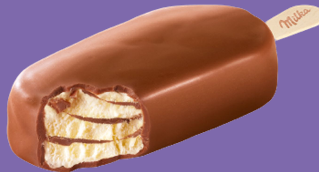
Milka Vanilla Classic Stick Impulse 20x90ml

Akullore me shije vanilje me pergatitje çokollate qumeshti.