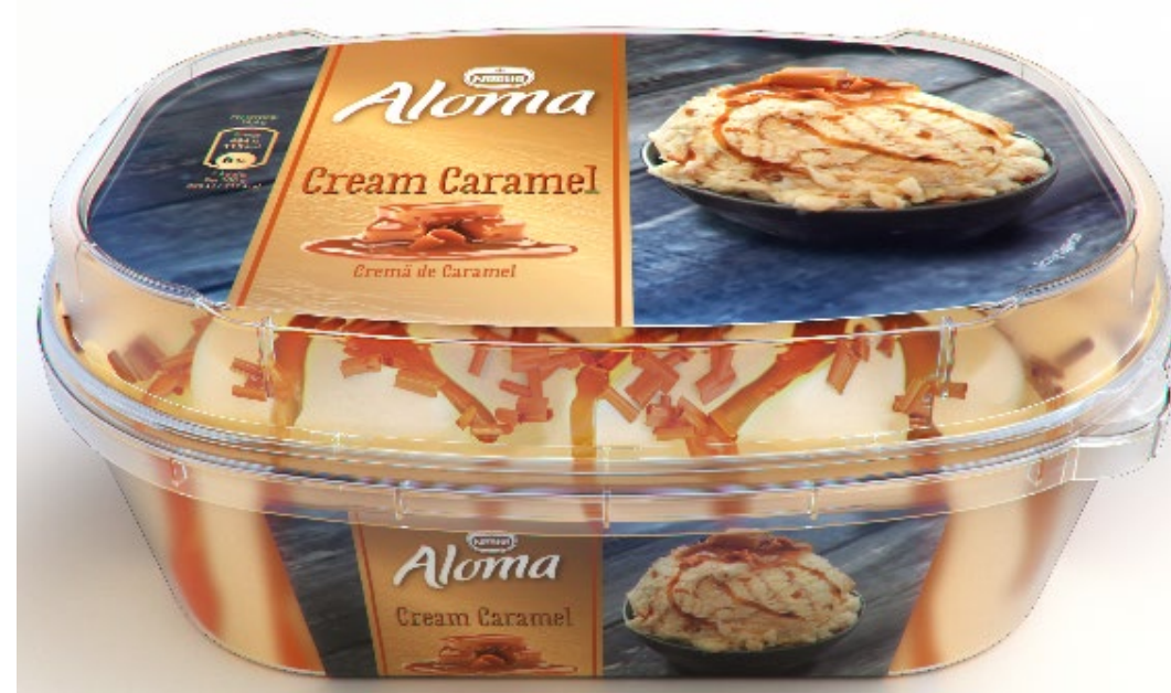
ALOMA Caramel Cream 6x900ml Caramel ice-cream with caramel syrup and caramel pieces