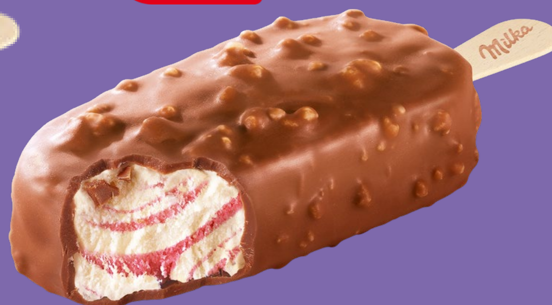
Milka Strawberry Cheesecake 20x90ml

Akullore e lehtë me shije cheesecake me luleshtrydhe dhe çokollatë.