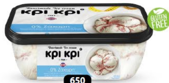
Vanilje 0% Sheqer