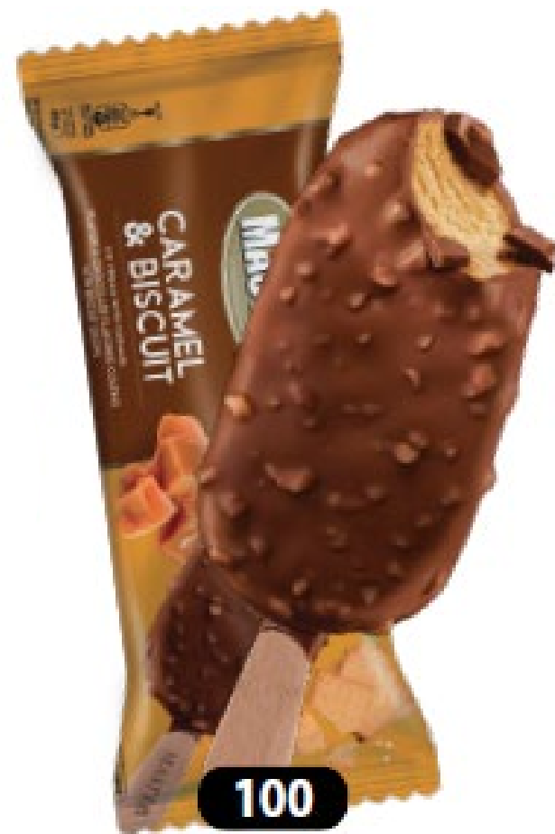
Karamel & Biskotë