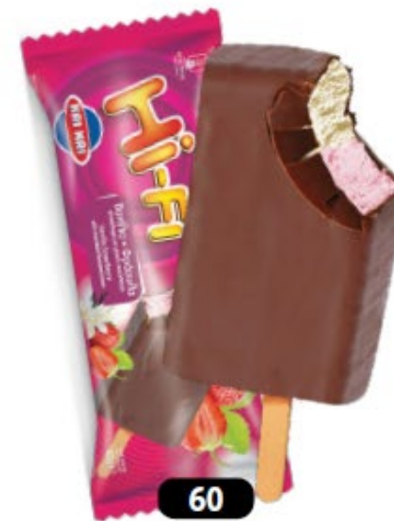
Vanilje & Luleshtrydhe