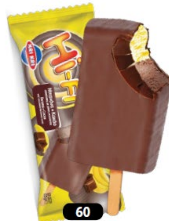
Kakao & Banane