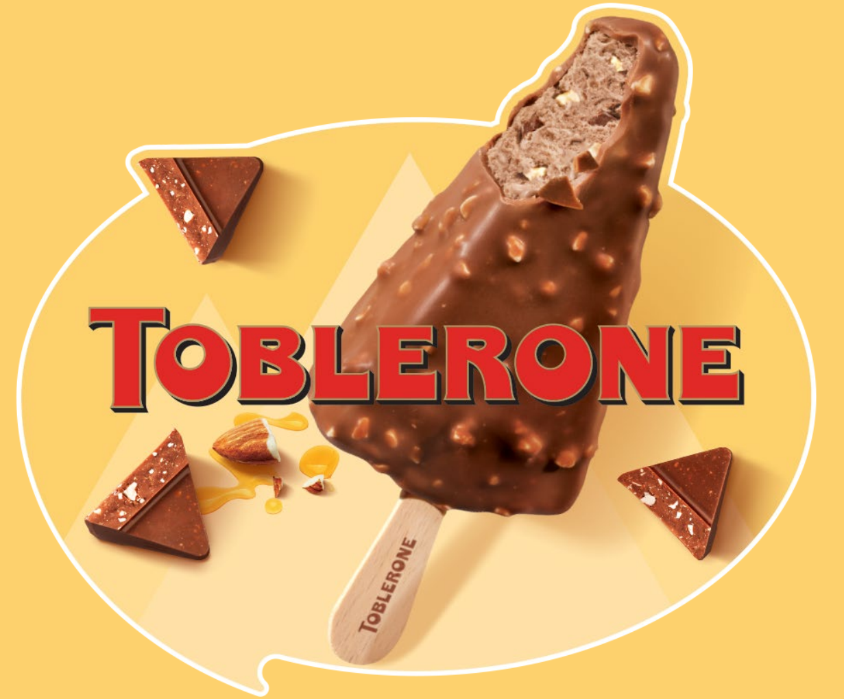
Toblerone Stick 20x90ml

Akullore me perberje mjalte cokollate dhe qumesht me copeza bajamash..