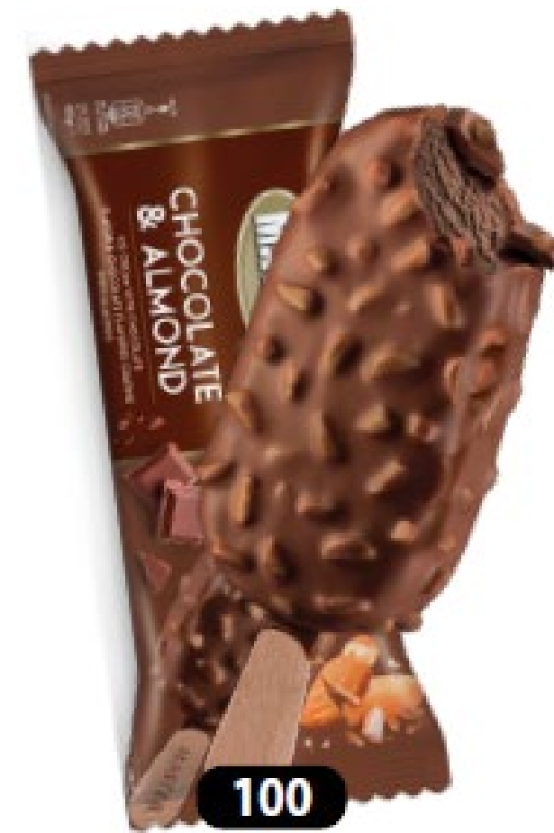
Bajame & Çokollatë