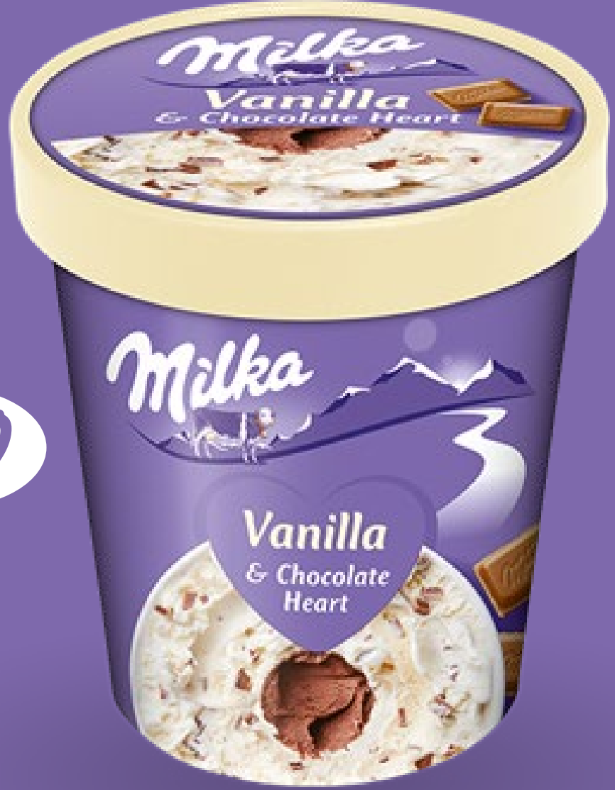
Milka Vanilla 6x480ml

Akullore me shije Vanilje me copeza cokollate dhe me mbushje cokollate brenda.