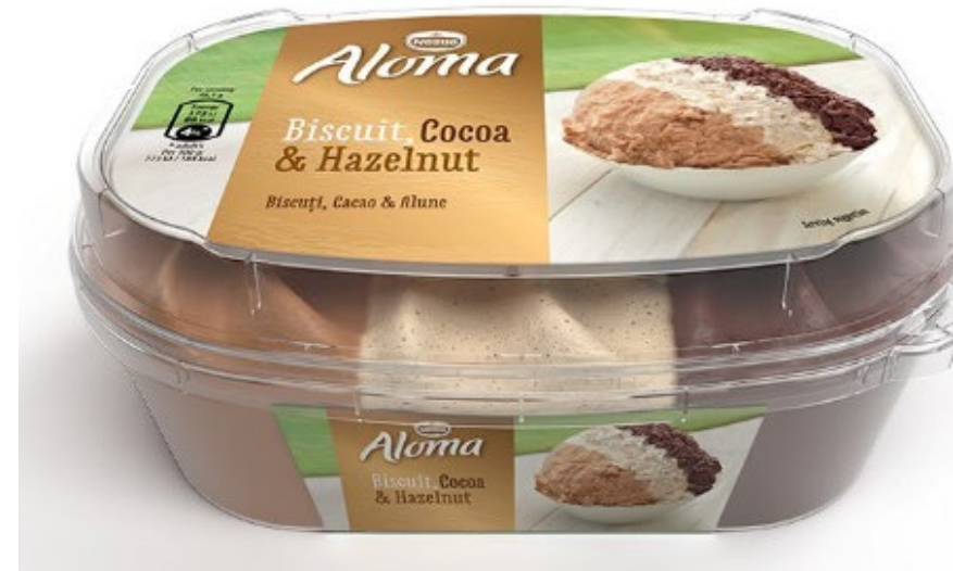
ALOMA 3in1 Choco 6x900 ml Miks Cocoa, lajthi dhe biskote.