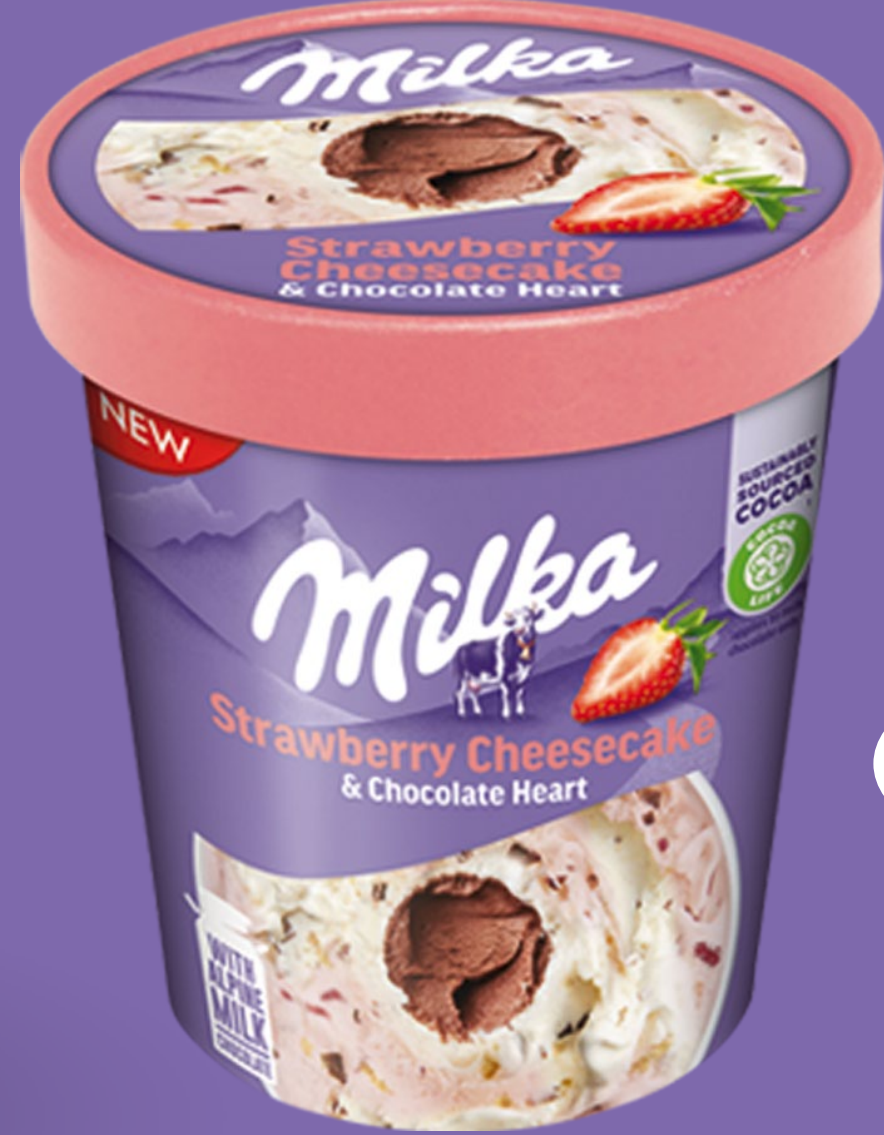
Milka Strawberry Cheesecake 6x480ml

Akullore e lehtë me shije cheesecake me luleshtrydhe dhe çokollatë,