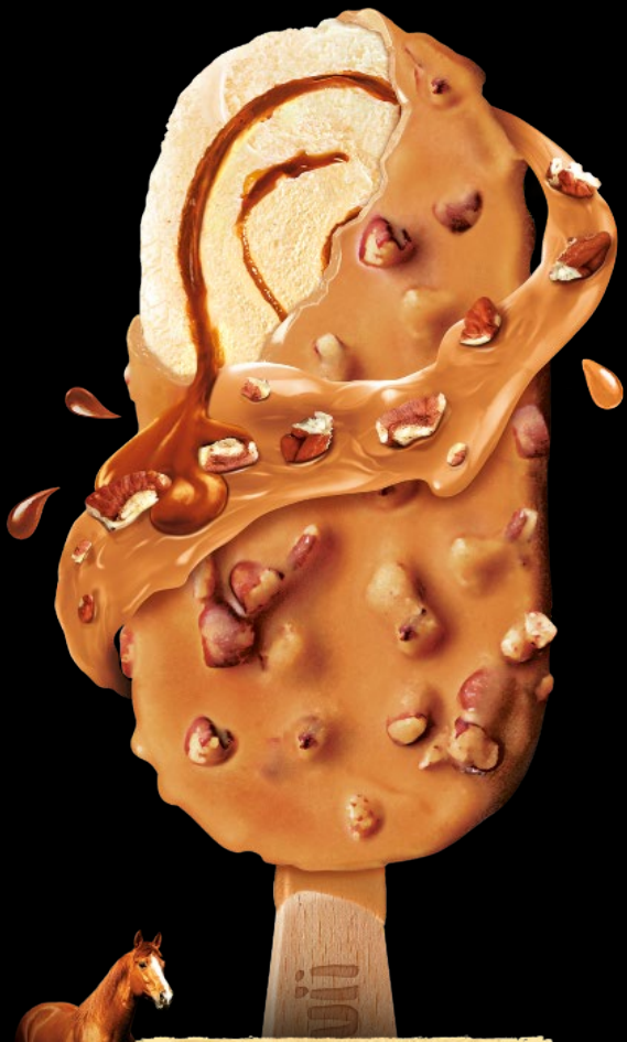
CARAMEL WHITE CHOCOLATE & TEXAN PECAN