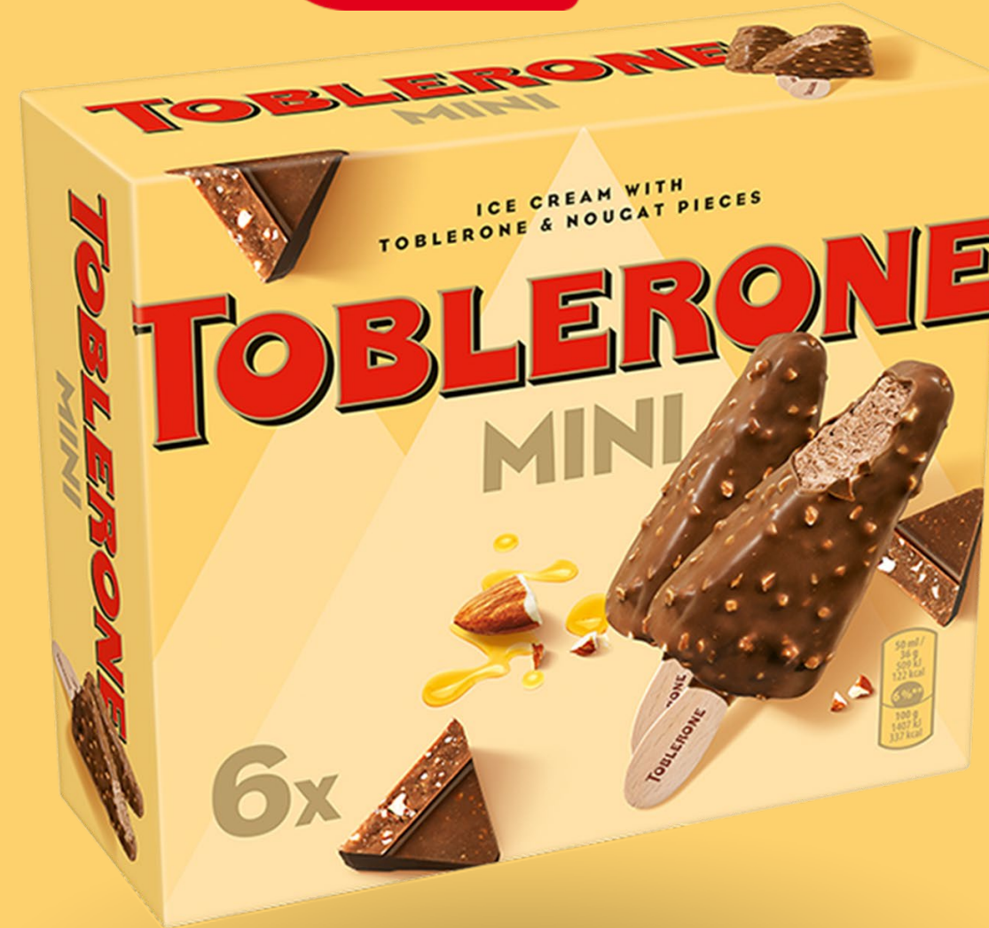
Toblerone Multipack Mini Stick 6x50ml

Akullore me perberje mjalte cokollate dhe qumesht me copeza bajamash..