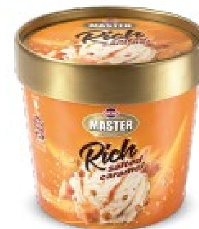
200 Karamel i kripur