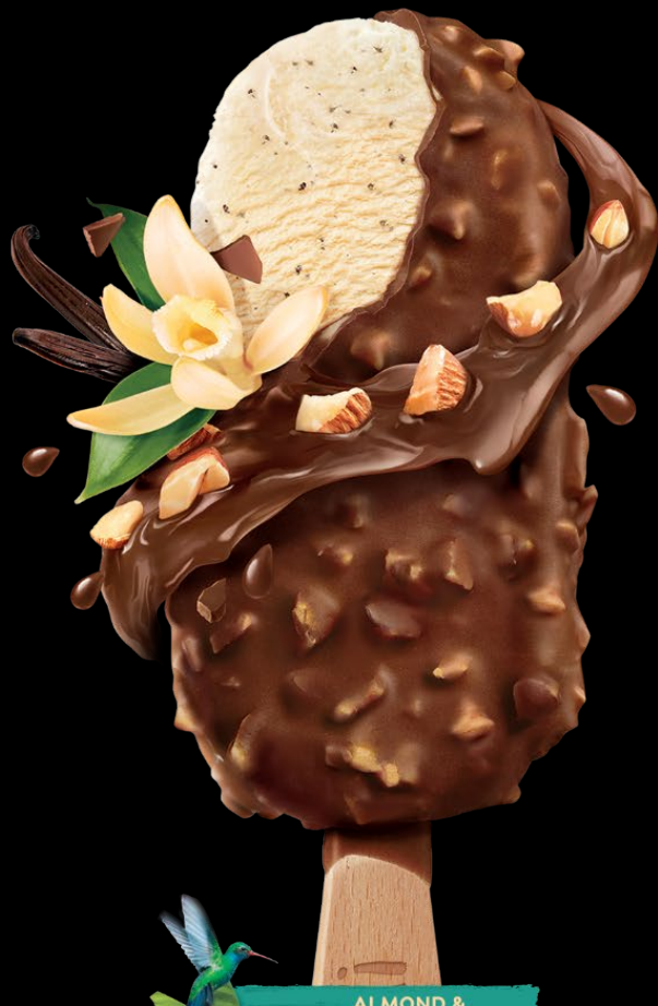
ALMOND & JAVA VANILLA