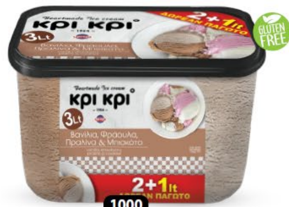
Vanilje, Luleshtrydhe, Biskotë & Praline