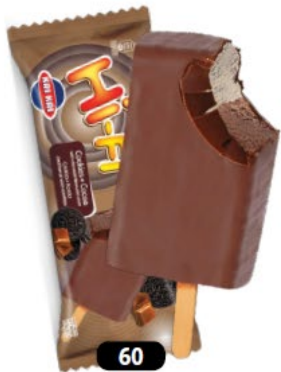
Çokollatë & Biskotë