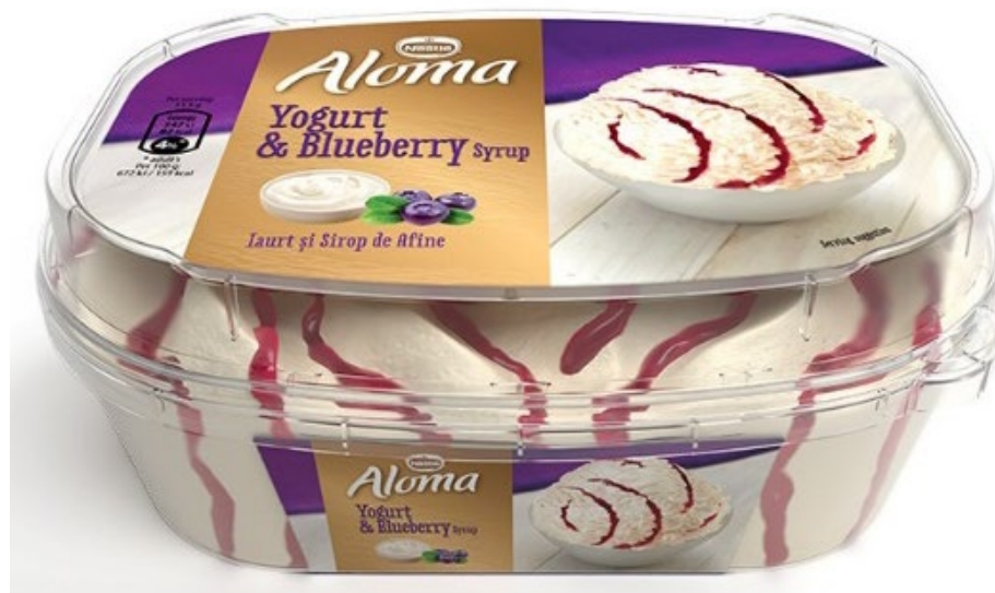
ALOMA YOGURT & BLUEBERRY syrup 6x900 ml Akulllore Yogurt me shurup boronice.