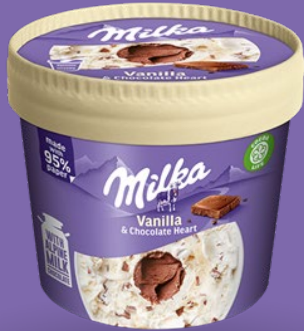
Milka Vanilla Choco Cup 20x145ml

Akullore me shije Vanilje me copeza cokollate dhe me mbushje cokollate brenda.