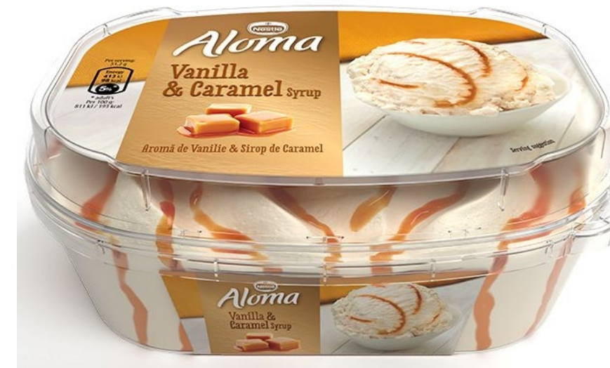
ALOMA VANILLA CARAMEL SYRUP 6x900 ml Akulllore me shije vanilje me shurup caramel.