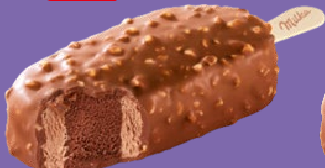
Milka Praline stick 20x90ml

Akullore shije lajthie me çokollatë qumështi dhe e mbuluar me copa lajthie të pjekura