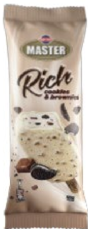
200 Brownies dhe Biskota