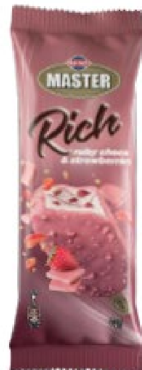
200 Çokollatë Ruby & Luleshtrydhe