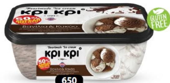
Vanilje & Kakao