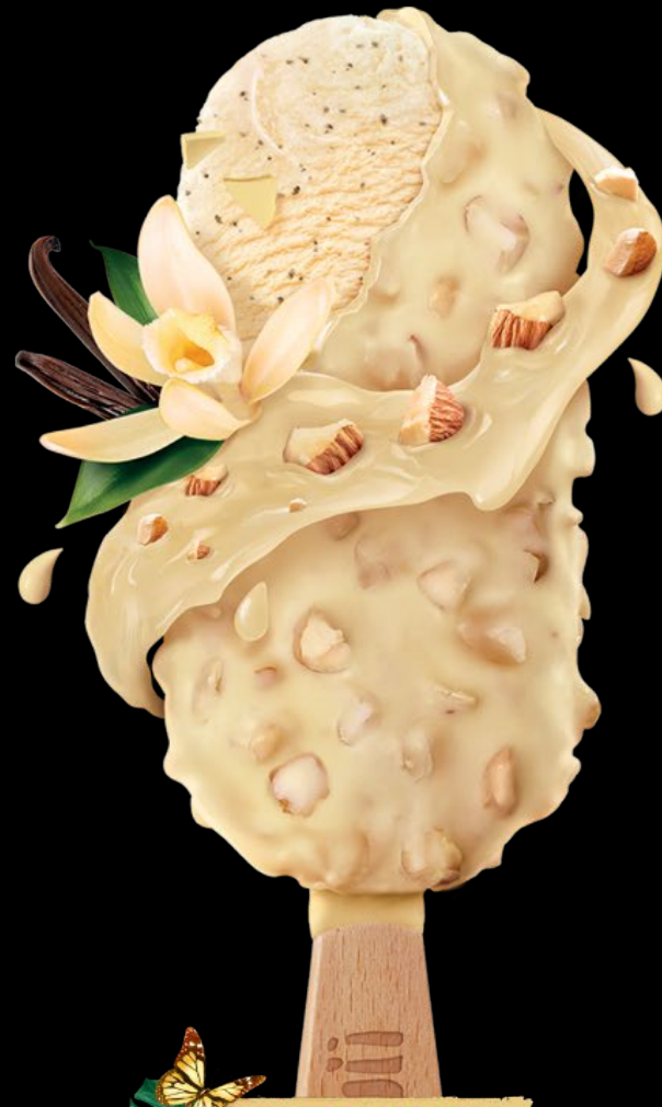
WHITE CHOCOLATE & JAVA VANILLA