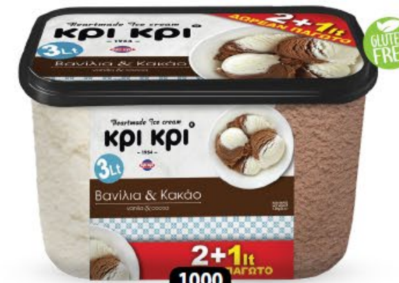
Vanilje & Kakao