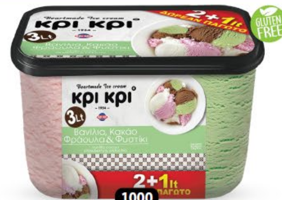
Vanilje, Kakao, Luleshtrydhe & Kikirik